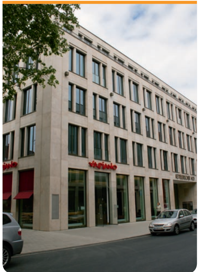
The „Kettlersche Hof“ in the heart of Münster.