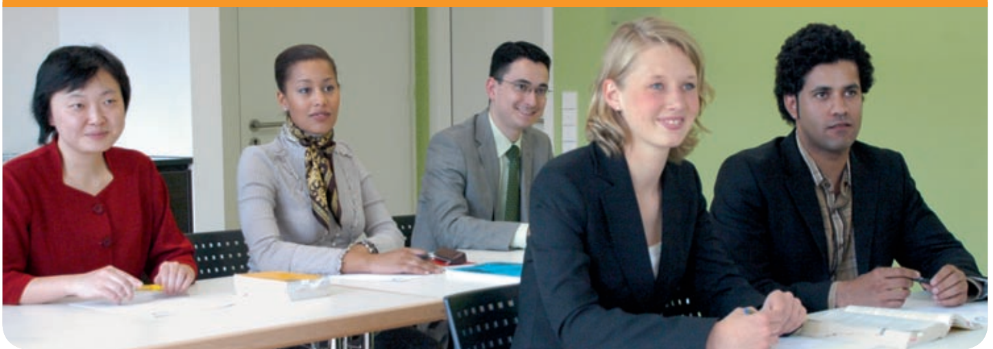
The courses take place in a pleasant atmosphere.